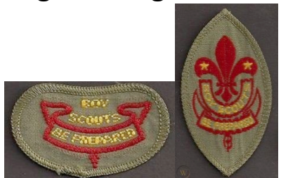
2 nd Class Badge