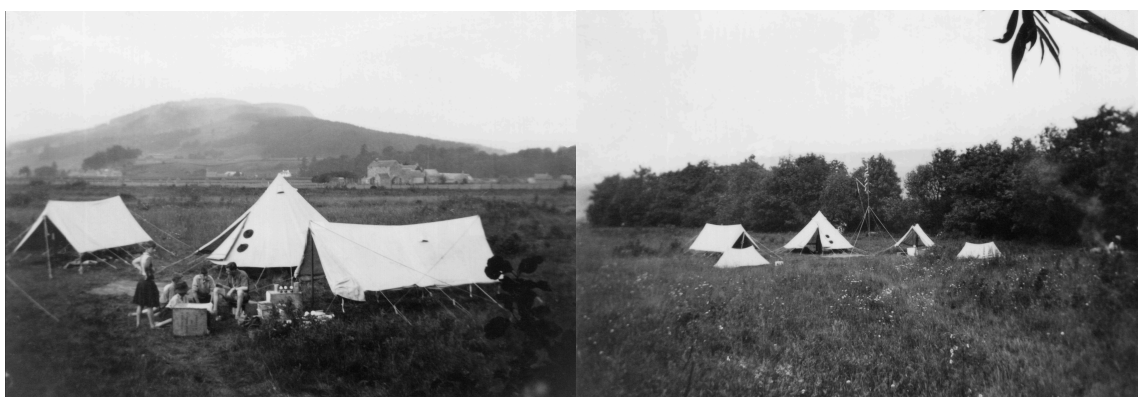
The only photographs known to have been taken at the 1937 Summer Camp. The first photograph shows Ian Dunlop or Ian Hardie talking to four Scouts (not identified). Tentage consists of 1 Bell tent, 2 Patrol tents and 2 biker tents. The mill of Logierait is visible in the background.