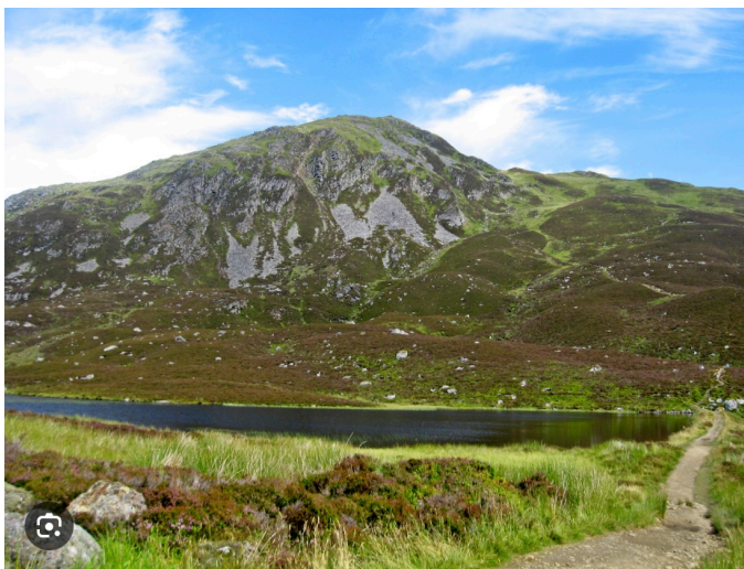
Ben Vrackie as it looks today

6. There is no hill called 'Moulin Hill' and it is assumed that the walk was up Ben Vrackie (2759 feet) which is next to the village of Moulin. In the 1930s, a path led from the village of Moulin to the reservoir at the base of the mountain, but there was no path marked for the actual ascent.