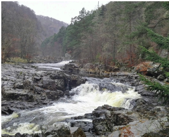
Falls of Tummel