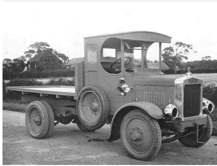
Possible model of lorry described in the Log book report.

2 The same travel arrangements described in getting to camp were followed in reverse.