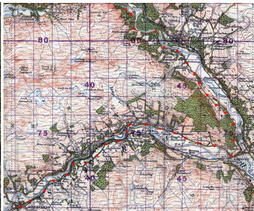
Possible Cycle route taken (red dots)